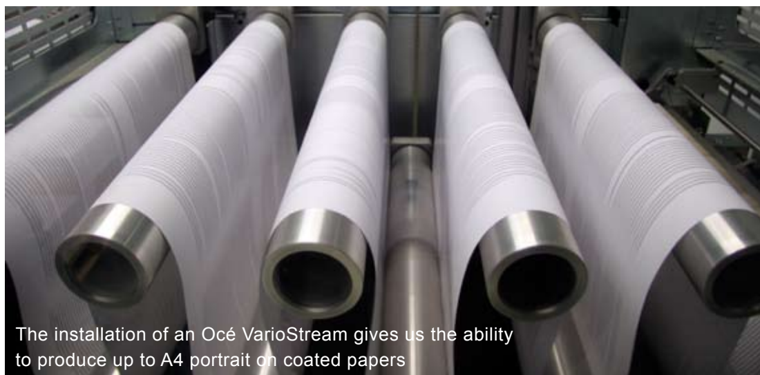
The installation of an Océ VarioStream gives us the ability to produce up to A4 portrait on coated papers

P4 Try a finishing touch for FREE on your next hardback order